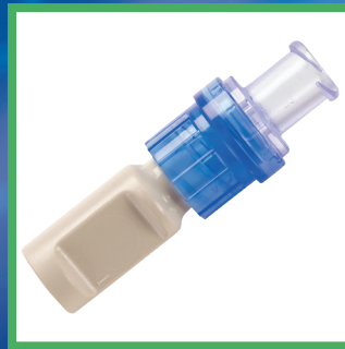
Torrent® scope connector for Olympus scopes