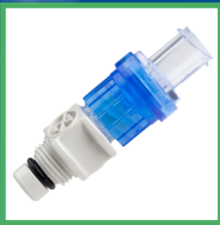
Torrent® scope connector for PENTAX scopes