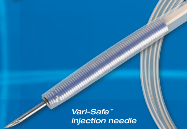
Vari-Safe™ injection needle

For more information on the injection needles, contact US Endoscopy today.