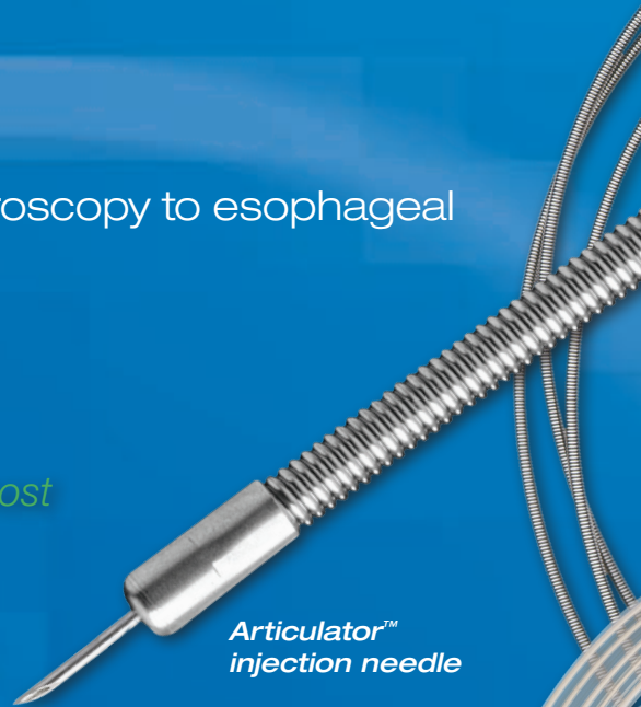
Articulator™ injection needle

Ideal for everyday use and dependable for your most immediate needs